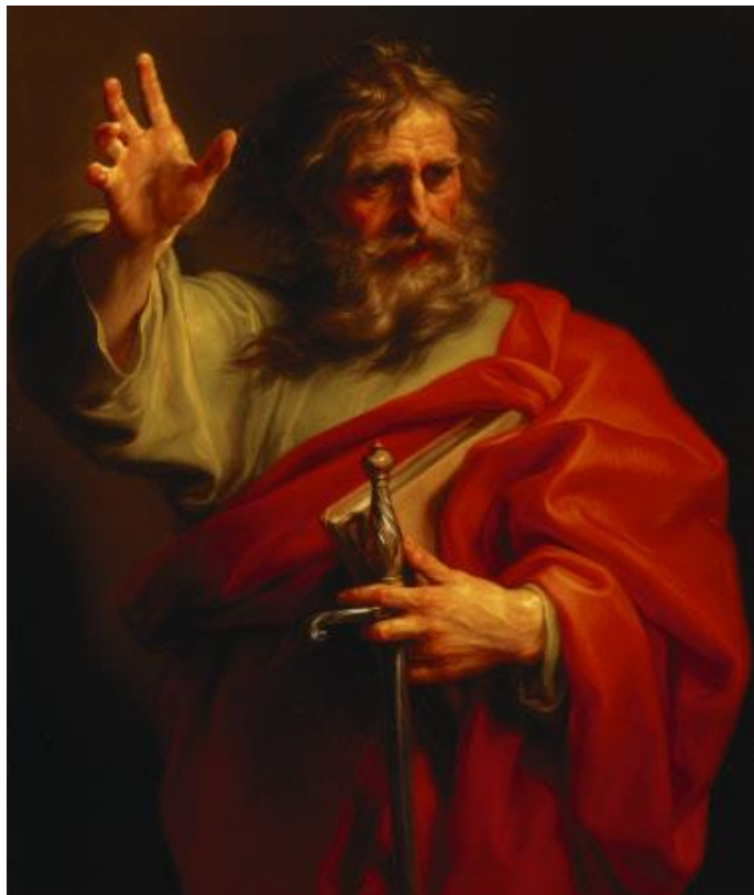
St Paul – Pompeo Batoni (1708-1787) 1740-43 Basildon Park, Berkshire