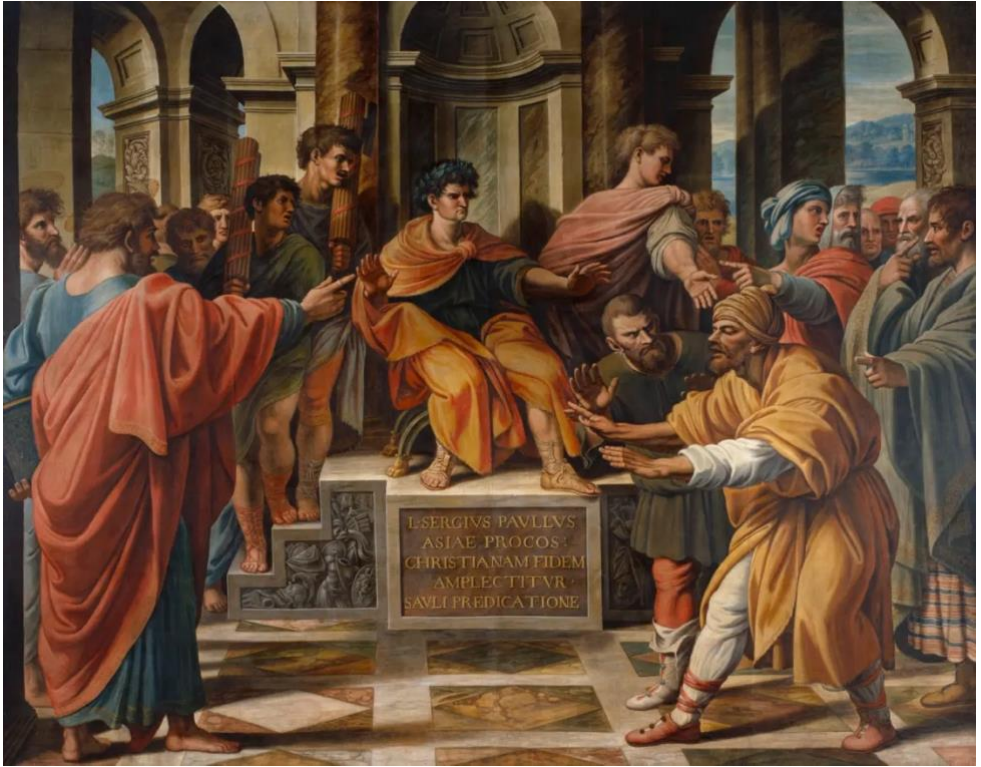
The blinding of Elymas – Raphael (1483-1520) 1515 Victoria and Albert Museum, London