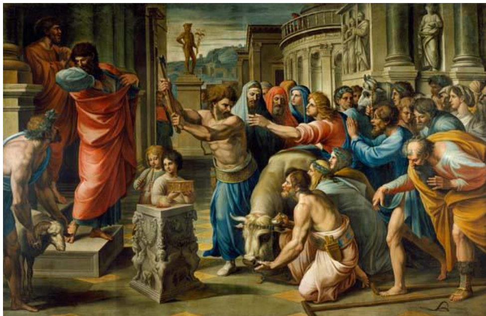
Paul and Barnabas at Lystra – James Thornhill (1675-1734) 1729-31, after Raphael (1483-1520) Royal Academy of Arts, London