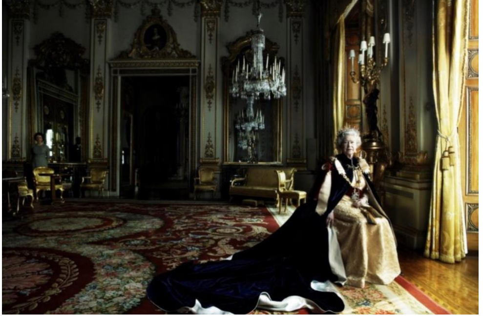
Photograph by Anne Leibowitz in Buckingham Palace, 2007